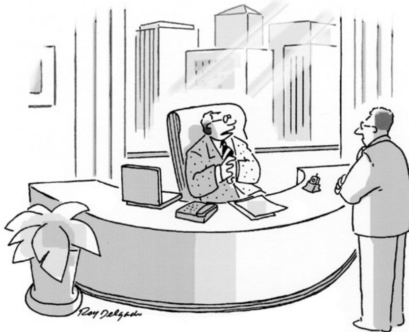
“Some men are born great, some achieve greatness, and some are allowed to work for great men like me.”